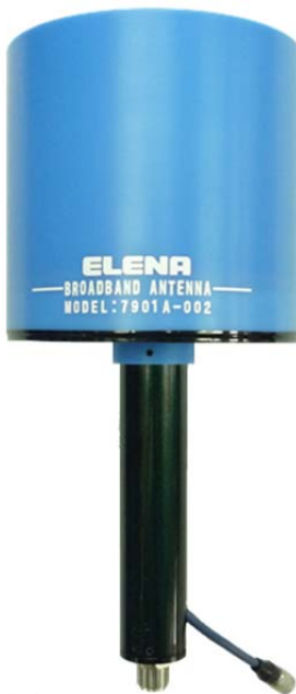
FHA7901A-002 (0.6kg) [NVLAP standard cal.]