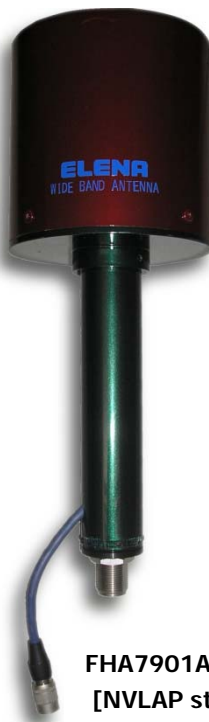
FHA7901A-001 (0.35kg) [NVLAP standard cal.]